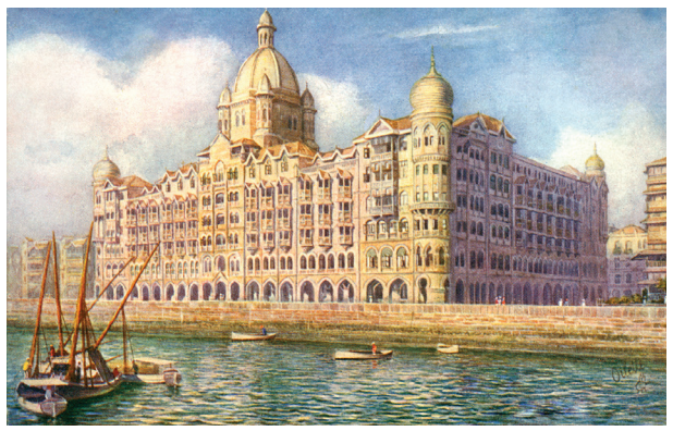
Taj Mahal Hotel, Bombay Raphael Tuck & Co., London, c. 1905 Omar Khan Collection