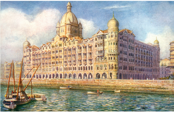
Taj Mahal Hotel, Bombay Raphael Tuck & Co., London, c. 1905 Omar Khan Collection